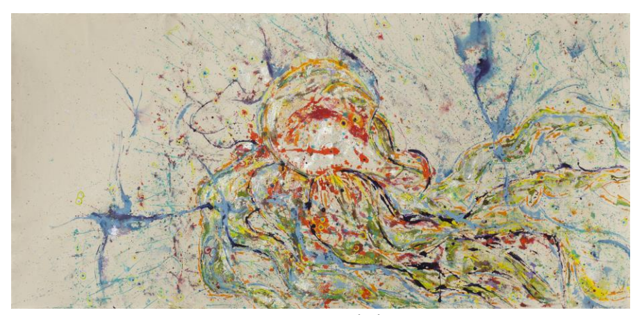
Karen Lee Sobol Nobody's Nomads, lagoon medusa, 2022 Mixed media on canvas, 34 x 72 inches

168 Newbury Street | Boston, MA | 02116 617-266-1108 | childsgallery.com